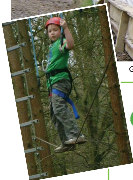
The cubs soon got the hang of all the activities.