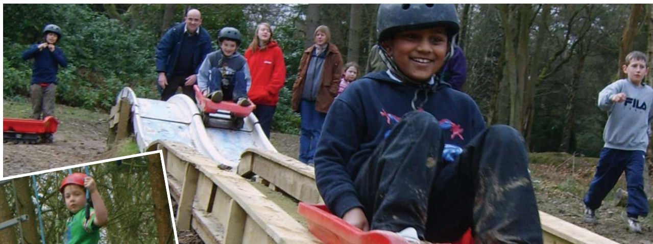
Grass sledging proved to be very competitive.